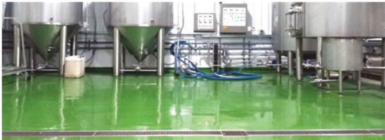
Brewery Floor - Installed by IFT