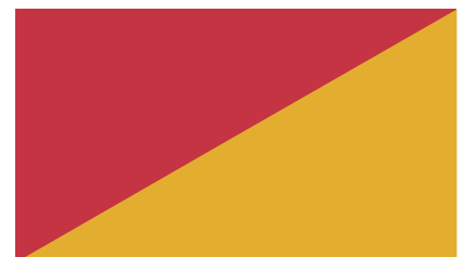
Safety Red / Yellow *▲

The colours shown may differ from the original product due to reprographic and technological media variations. The same colour in different products may also vary due to the composition and texture of the final finish. If colour and final aesthetics are of concern, please contact us to request an actual sample of the colour and system required.