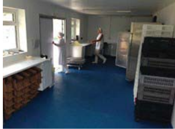
Cheese Production Floor - Installed by IFT