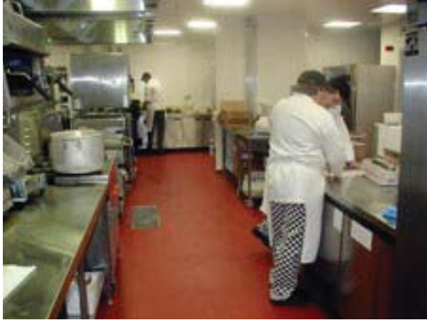
Commercial Kitchen Floor - Installed by IFT