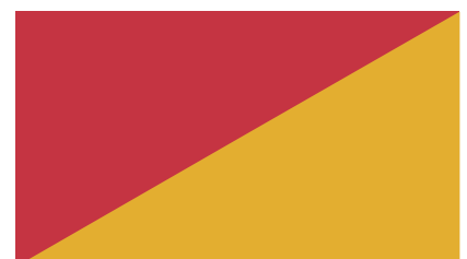
Safety Red / Yellow *▲

The colours shown may differ from the original product due to reprographic and technological media variations. The same colour in different products may also vary due to the composition and texture of the final finish. If colour and final aesthetics are of concern, please contact us to request an actual sample of the colour and system required.