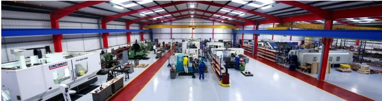
Precision Engineering Facility - Installed by Industrial Floor Treatments (Stone) Ltd